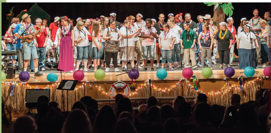
The enthusiasm was contagious! The FOLLIES performers gave it their all!