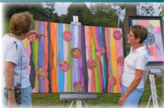
Art in the Garden