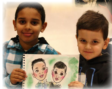
These two guys show off the fun caricature they had done.