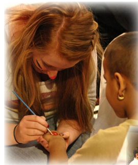
Below: A young man gets his hand painted.