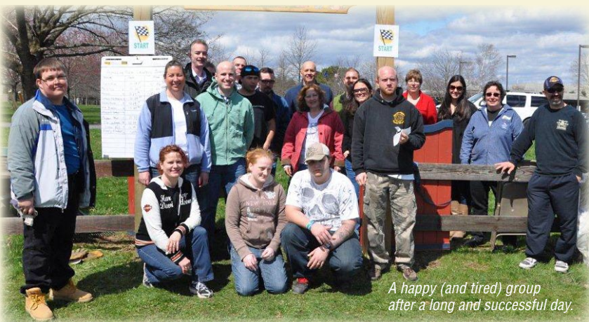
A happy (and tired) group after a long and successful day.