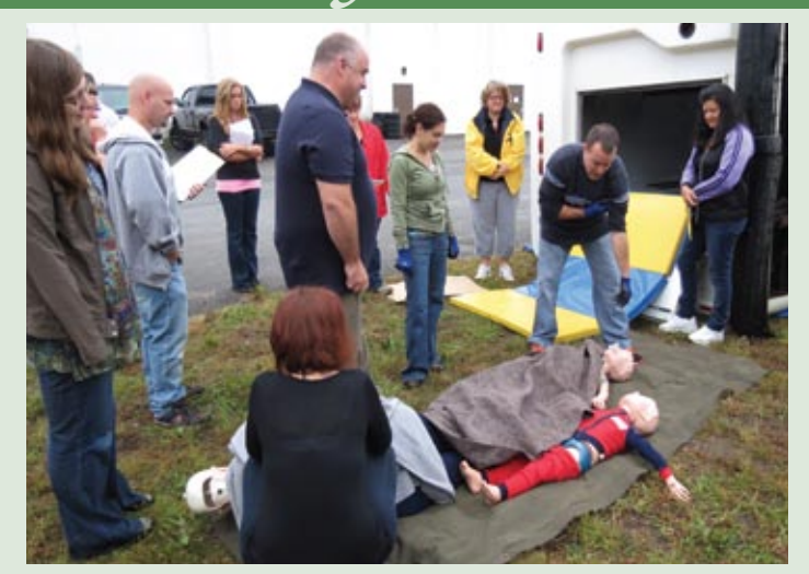
Above: Emergency EVAC training participants discuss what to do in a van rollover accident with

C afety is a top priority at Liberty. The Safety Office, in conjunction with the Training Department, held four EVAC Training sessions at Liberty's bus garage. Three different simulated scenarios involved an emergency in which a wheelchair van rolled over with "victims" trapped inside. The classroom training presented seven steps to crisis management, which can be applied to any transportation emergency according to the National Rural Transit Assistance Program, administered by the Federal Transit Administration Program. Participating staff gave very positive feedback. Many thanks to Staff Training for the loan of their "victims" and their support in this training.