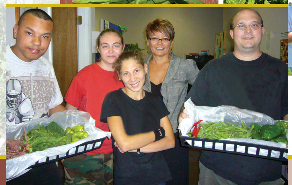
Liberty gardeners show their pride as they bring much-needed donations of fresh fruits and vegetables to local charities. This healthy and nutritious produce will provide assistance to local families in need.

Caring About Each Other. Committed to the Community.