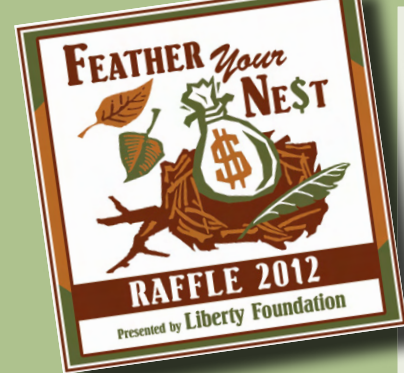
Checks payable to Liberty Foundation.