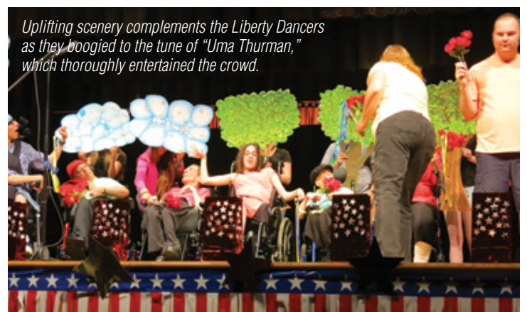
Uplifting scenery complements the Liberty Dancers as they boogied to the tune of "Uma Thurman," which thoroughly entertained the crowd.