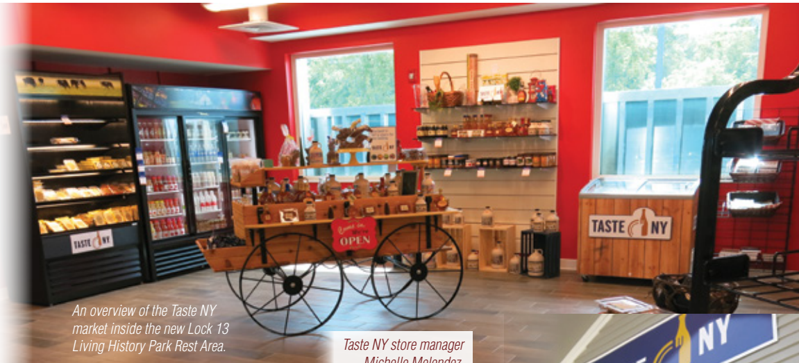
An overview of the Taste NY market inside the new Lock 13 Living History Park Rest Area.