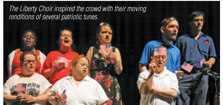
The Liberty Choir inspired the crowd with their moving renditions of several patriotic tunes.