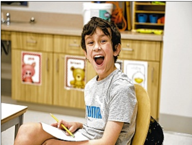
More than 70 students at Broadalbin-Perth Elementary School are participating in the Project Summer Program, which offers an enriching summer experience that goes beyond the average summer school, according to a news release.